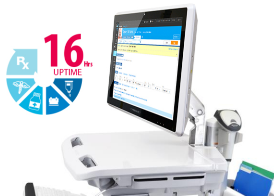
Hot Swap Batteries allow for up to 16 hours of up time without plugging into a power source.

Medical grade hardware manufacturers use very high grade discrete components (capacitors, resistors, transistors, diodes, etc.) in its manufacturing of motherboards and PCBs; all are designed to last 5+ years and provide a strong MTBF (Mean Time Between Failures) of 50,000+ hours. However, other Tier 1 manufacturers use standard commercial grade discrete components that have a much lower MTBF. Medical grade computers are designed for the reliability needed to sustain 24/7 hospital operations, and reduce the time and cost of routine maintenance. That's why reliability is an important part of the "medical grade" definition. The use of industrial and military grade components also results in a much lower failure rate for medical grade computers compared to their Tier-1 counterparts.